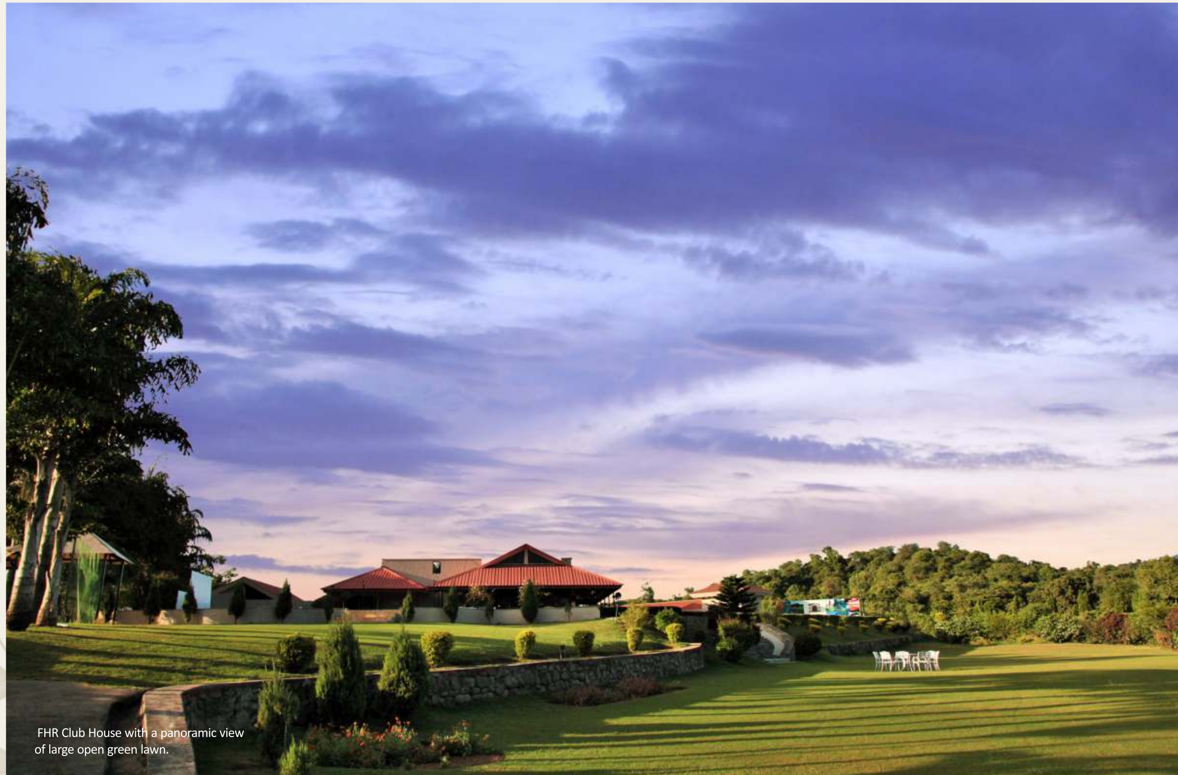
FHR Club House with a panoramic view of large open green lawn.