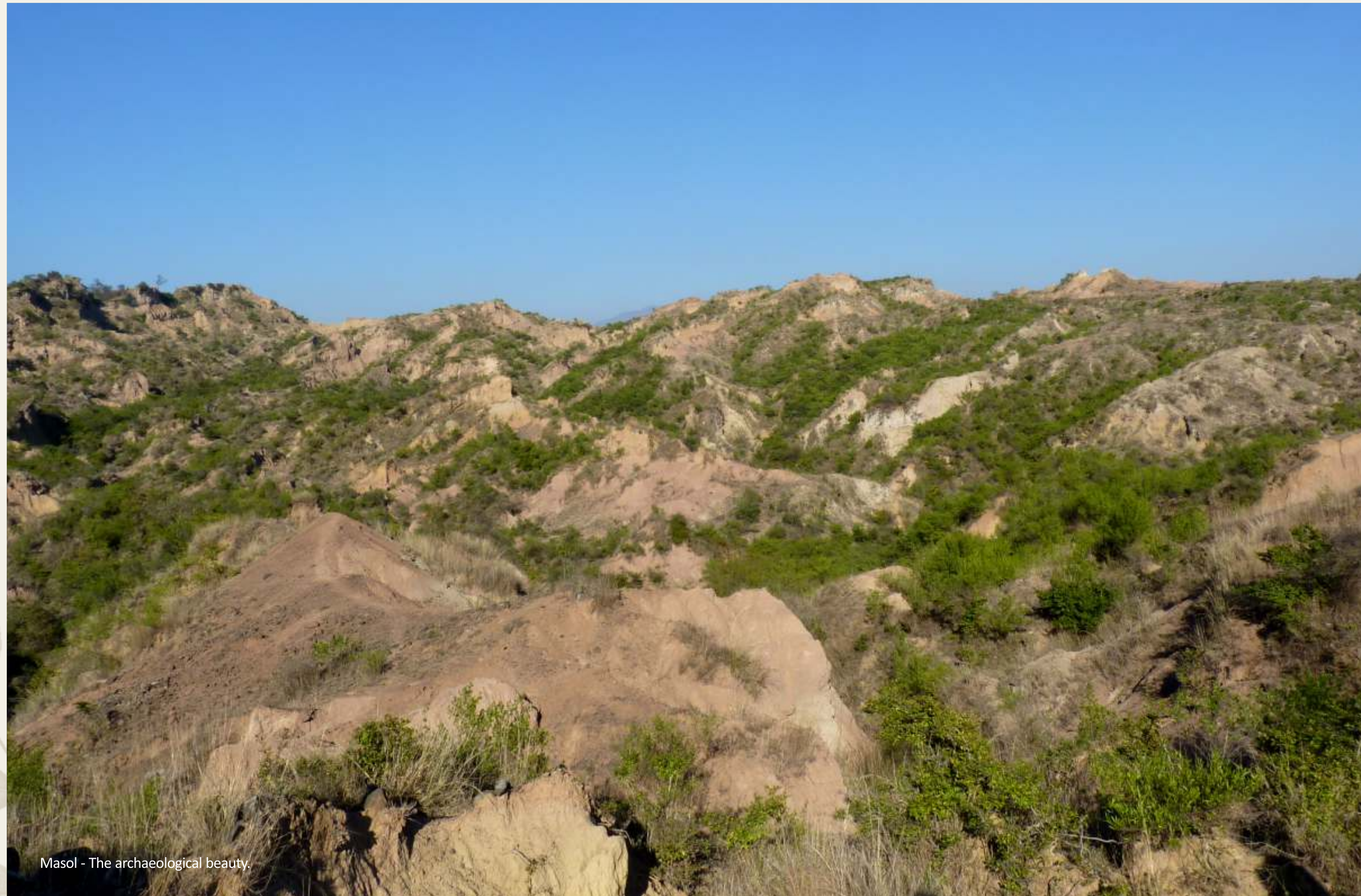
Masol - The archaeological beauty.