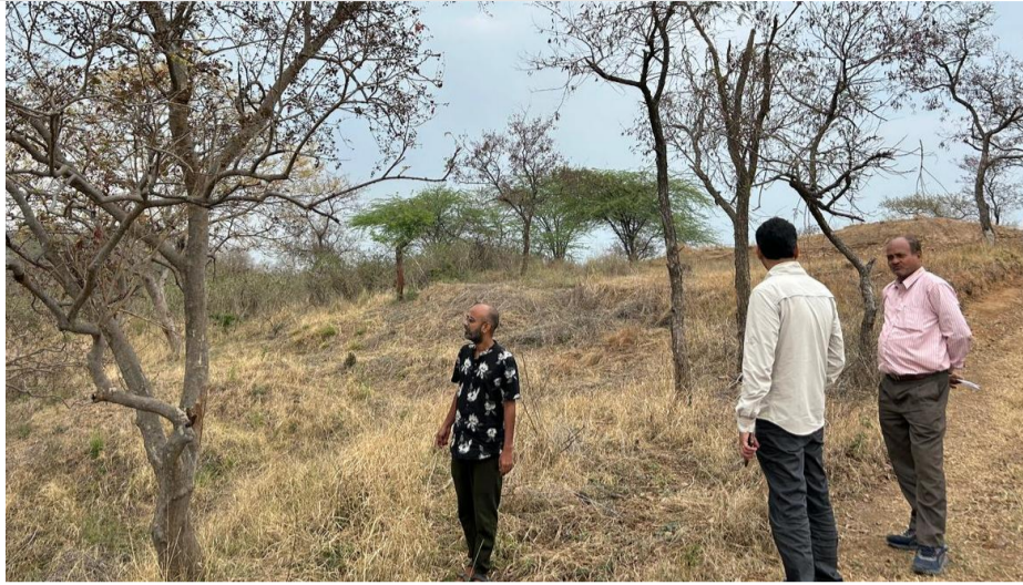
Rewilding and habitat restoration being done at Forest Hill Resort in collaboration with Afforestt

"We think of this as a journey, not a project with a fixed endpoint. In five years, the landscape will show